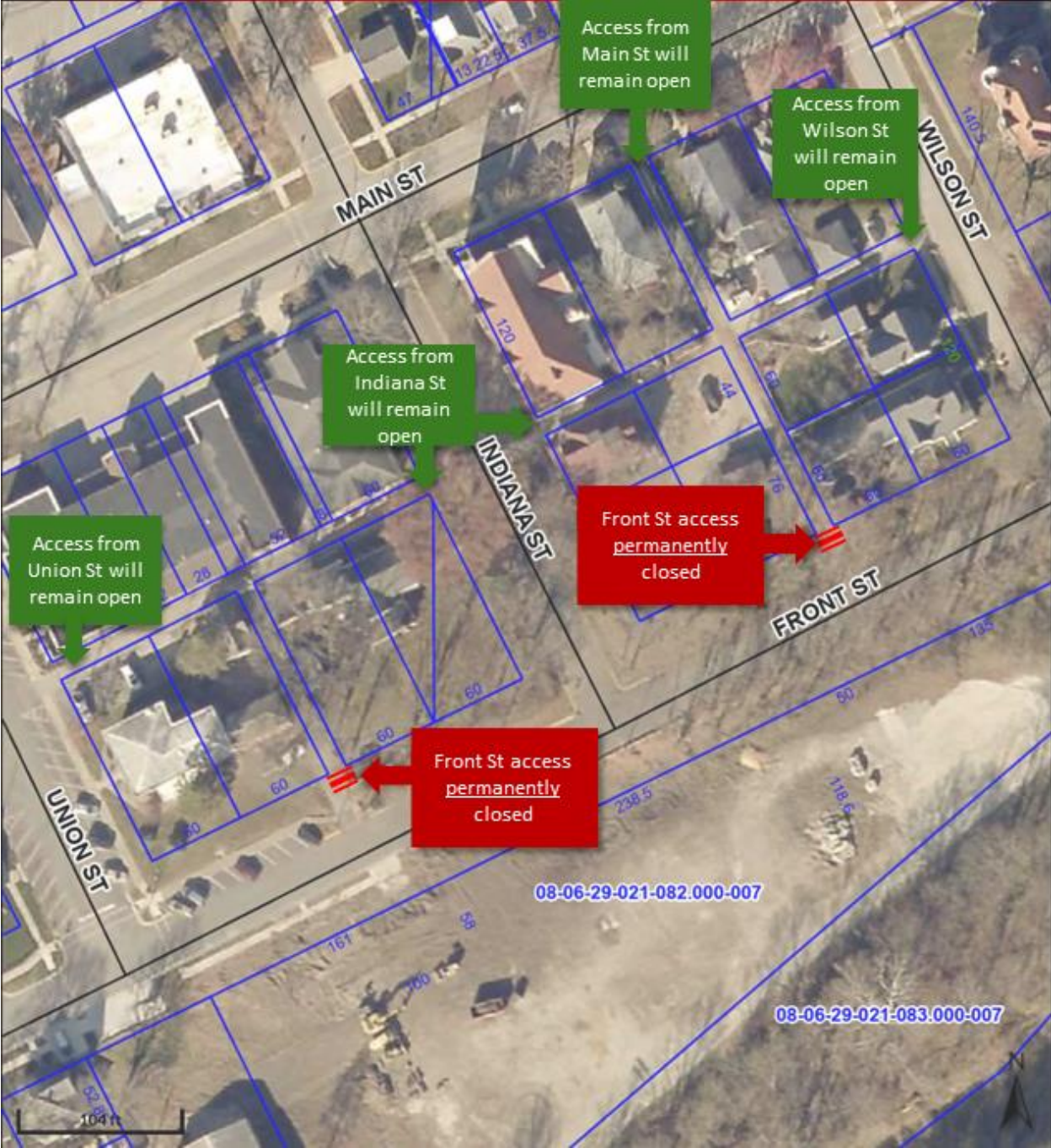
Exhibit A Closures of Front Street Alley Access