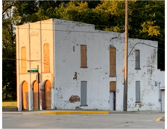
402 S. Washington 2023